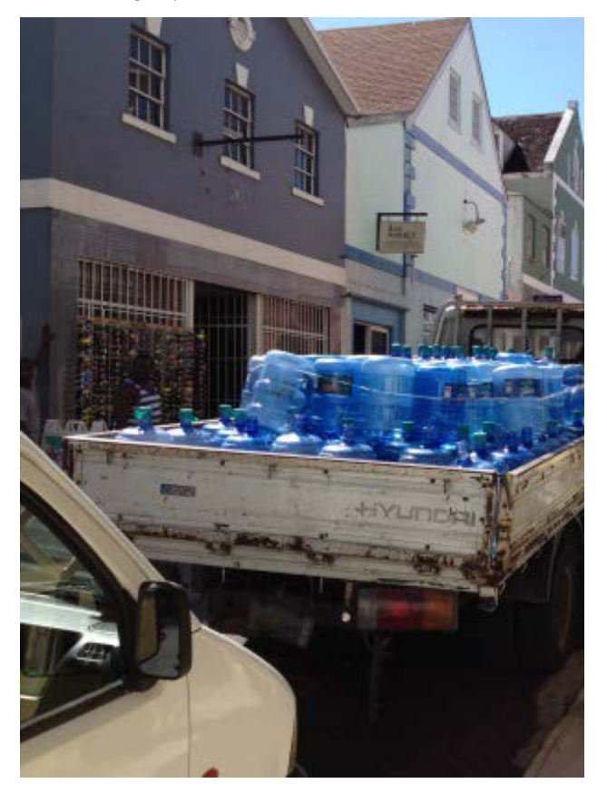
Figure 3. Bottled water delivery vehicle in Nassau, Bahamas (October 2014).