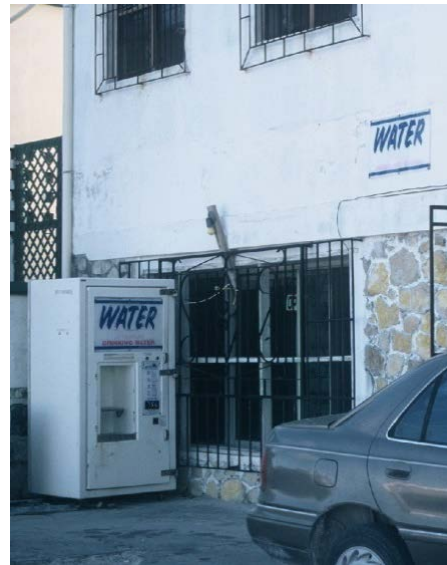
Figure 2. Water vending machine in Grand Turk, Turks and Caicos Islands (2002).

Specific projects, listed by country, include