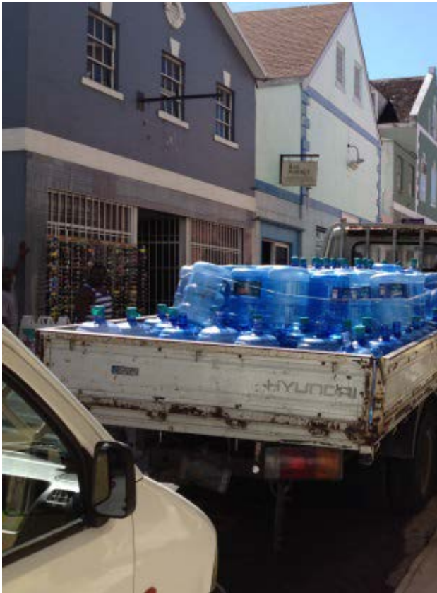
Figure 3. Bottled water delivery vehicle in Nassau, Bahamas (October 2014).